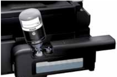
*Comparisons made against similarly-priced monochrome laser printers using third-party toner cartridges: Epson M100 and M200 printers using ink from T7741 ink bottles compared against monochrome multi-function laser printers costing below US$150 (incl. tax) and US$200 (incl. tax) respectively from most major brands. All information correct at time of publication.

Epson's proven original ink tank system printers deliver reliable printing with unrivalled economy. At just US 0.33 cents per mono printout that is 50% lower cost compared against third party refilled toner cartridges*, the M100 and M200 let you enjoy ultra high yield options of 6,000 pages, reducing the constant hassle of refilling. The M100 and M200 come bundled with an initial starter kit of 2 bottles of inks (140ml and 70ml) for a total yield of up to 8,000 pages.